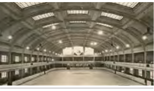
The Old Richmond Ice Rink in Fast Twickenham

installing a small ice rink in the grounds of York House this Christmas. We will be working on this project in the coming months and hope that you will support us.